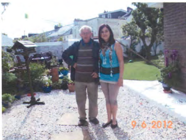
My hospitable father and me in the garden